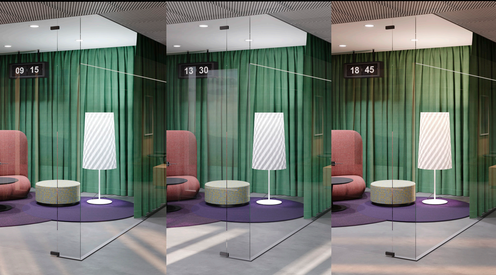
IN THE MORNING