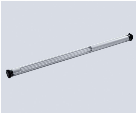
RL70E - 239