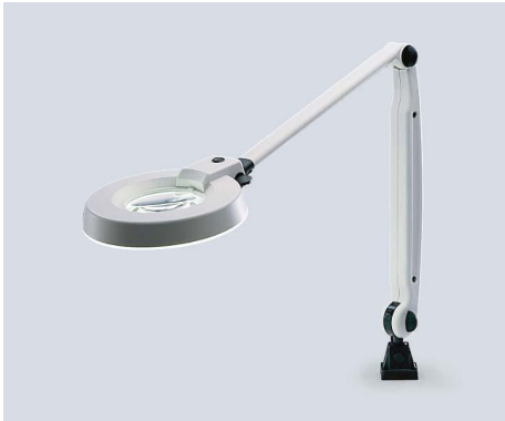
RLL E 122