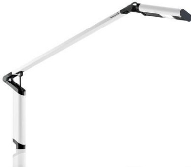
MINELA - ETL 1 F

power supply lamping operating device cord length luminaire body housing material arm material