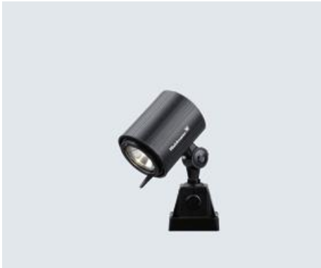
HIXF 20 N