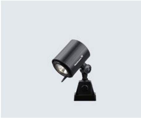
HIXF 20 S