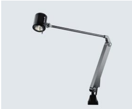
HIBF 20 S