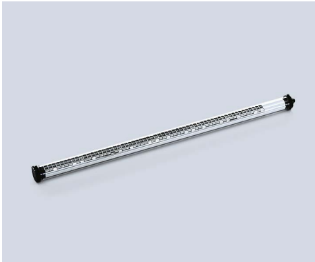
RL70 - 136 S