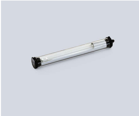
RL70C - 136 S