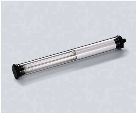
RL70CV - 124