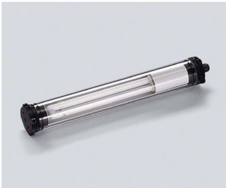
RL70C - 124 S