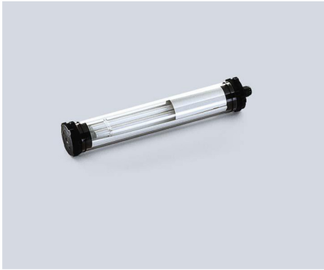
RL70C - 118 S