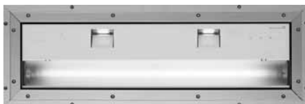
FLAT TEC HYBRID