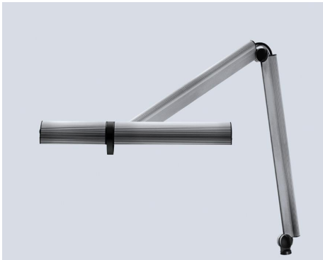
diva 910 - PTE 111

connected load fitted with work equipment mains lead luminaire body material surface tubular sections material surface weight (net) fastening power consumption technology usage glare-free class of protection colour luminaire body colour of tubular sections article no.