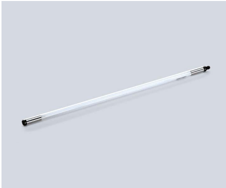
RL40 - 132 S