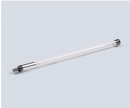
RL40 - 139 S