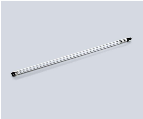
RL40 - 154 S