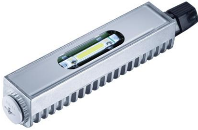
ONE LED - MVAL 1 S