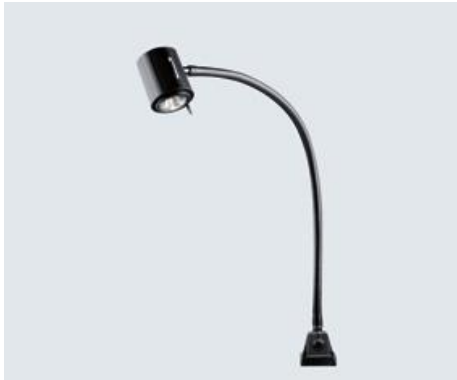
HITF 20 S

connected load fitted with radiation characteristic work equipment mains lead luminaire body material surface tubular sections material weight (net) fastening technology usage lamp cover system of protection class of protection colour luminaire body colour of tubular sections article no.