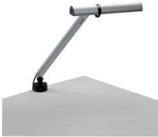
diva 920 - MPTE 111

connected load fitted with work equipment mains lead luminaire body material surface tubular sections material surface weight (net) fastening power consumption technology usage glare-free class of protection colour luminaire body colour of tubular sections article no.