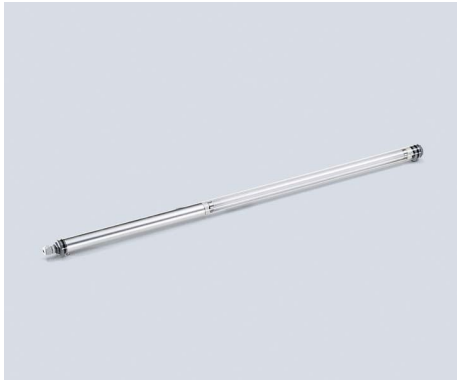
RL40E - 117