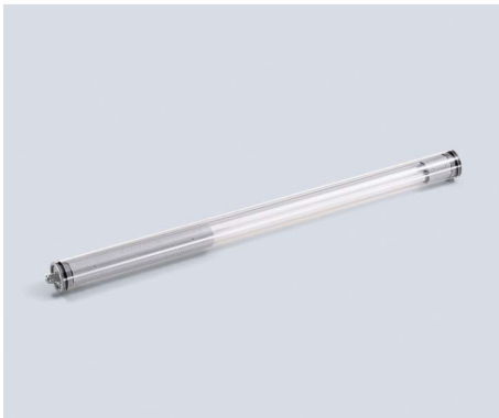
RL70E- 117 X