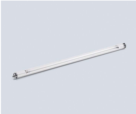
RL70E - 132 HD