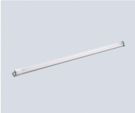
RL70E - 140 H