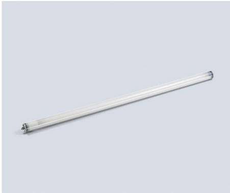
RL70E - 140 H