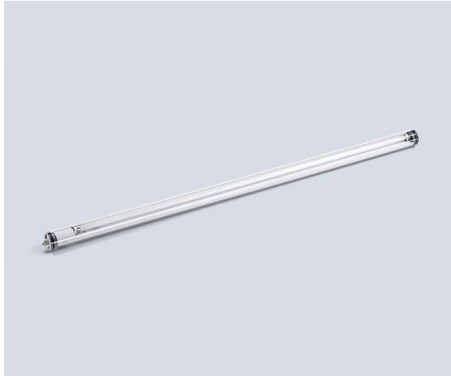
RL70E - 140 H