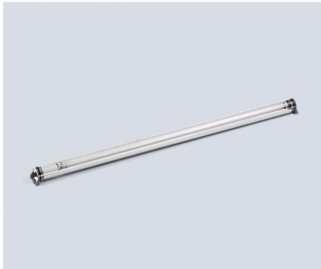
RL70E- 132 H