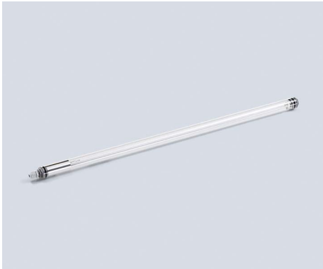
RL40 - 139 S