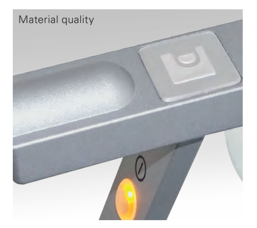
Light Management System