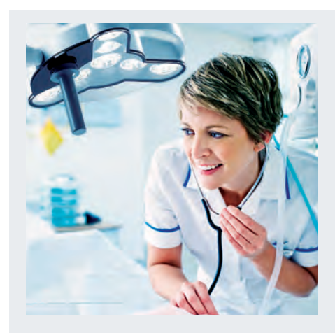
CLINICS • MEDICAL PRACTICES

Understanding the full range of applications necessary in the medical field is the basis of everything we do. Our ultimate goal is to offer energy-efficiency, sustainability, ease of use and timeless architectural design.