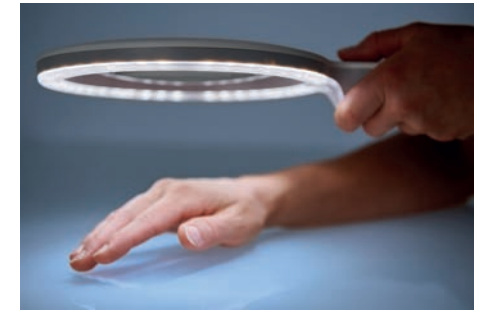
Outstanding light Unique light output with 8 000 lx at 0.15 m for a true-to-life color rendering