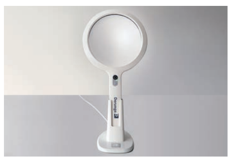
Optional charging base Robust design with high quality baseplate. USB integrated charing cable included.