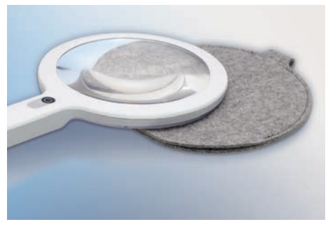
Optimally protected High quality felt cover protects the lens from scratches and sun exposure