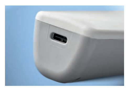
Battery powered Up to 3 hours runtime, convenient charging through USB-C port

The new OPTICLUX hand-held magnifier is the perfect choice for challenging visual tasks that require maximum accessability. This is thanks to its large, dimmable daylight quality, its excellent color rendering characteristics and its long battery life. Medical professionals will be excited to work with the powerful Wood's Light in addition to daylight mode.